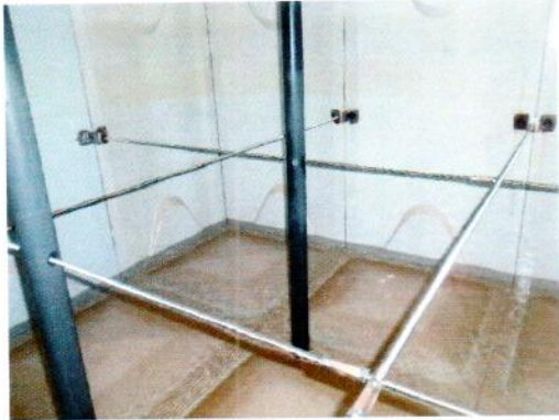
GRP Tank - 1 Before Cleaning